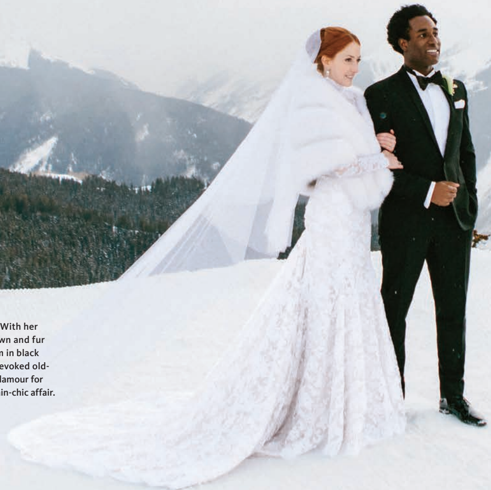
the couple With her dramatic gown and fur stole and him in black tie, the pair evoked old-Hollywood glamour for their mountain-chic affair.